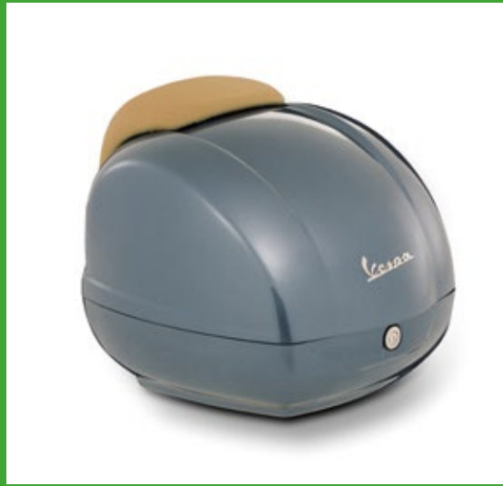
PAINTED TOP BOX