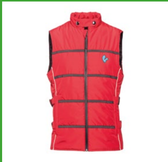
UNISEX SLEEVELESS VEST