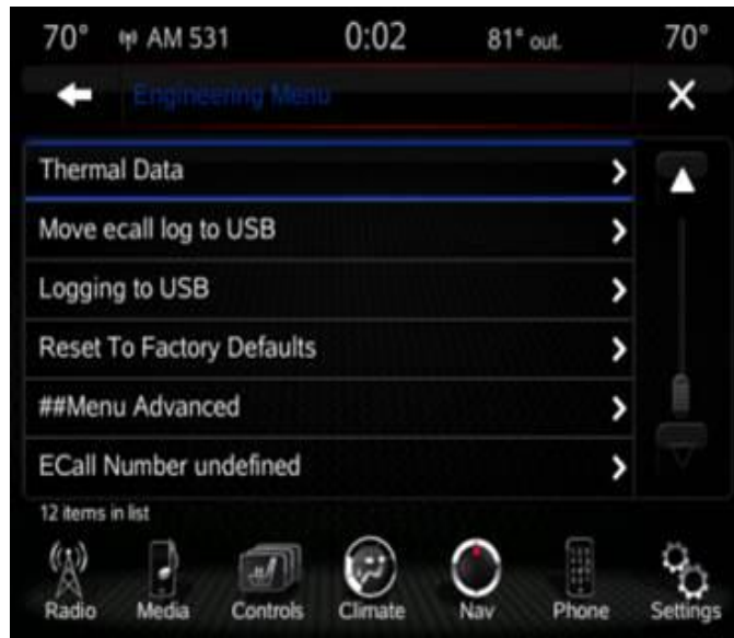
Fig. 7 Radio

27. Wait 30 seconds for radio to complete the reset process.