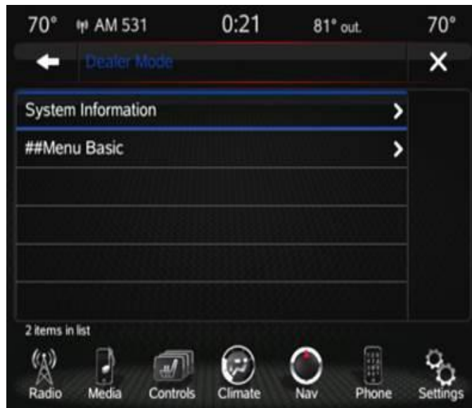
Fig. 2 Radio

6. Select Radio Part Information from the Menu (Fig. 3).