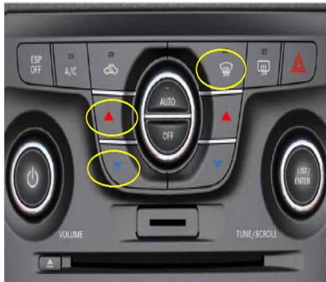
Fig. 1 Radio