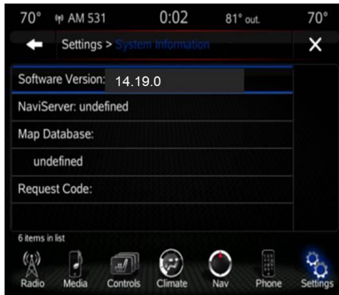
Fig. 6 Radio