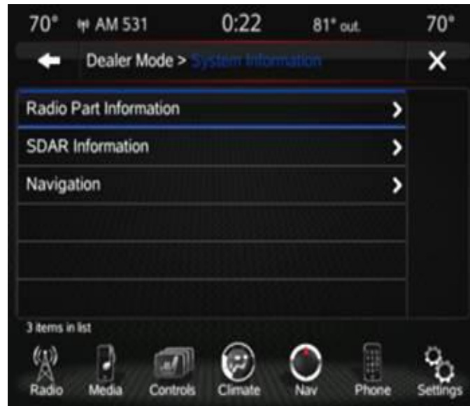
Fig. 3 Radio